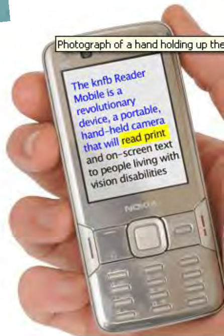
Photograph of a hand holding up the

The knfb Reader Mobile is a revolutionary device, a portable, hand-held camera that will read print and on-screen text to people living with vision disabilities