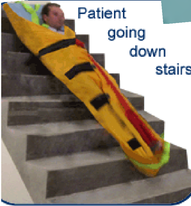
Patient going down stairs